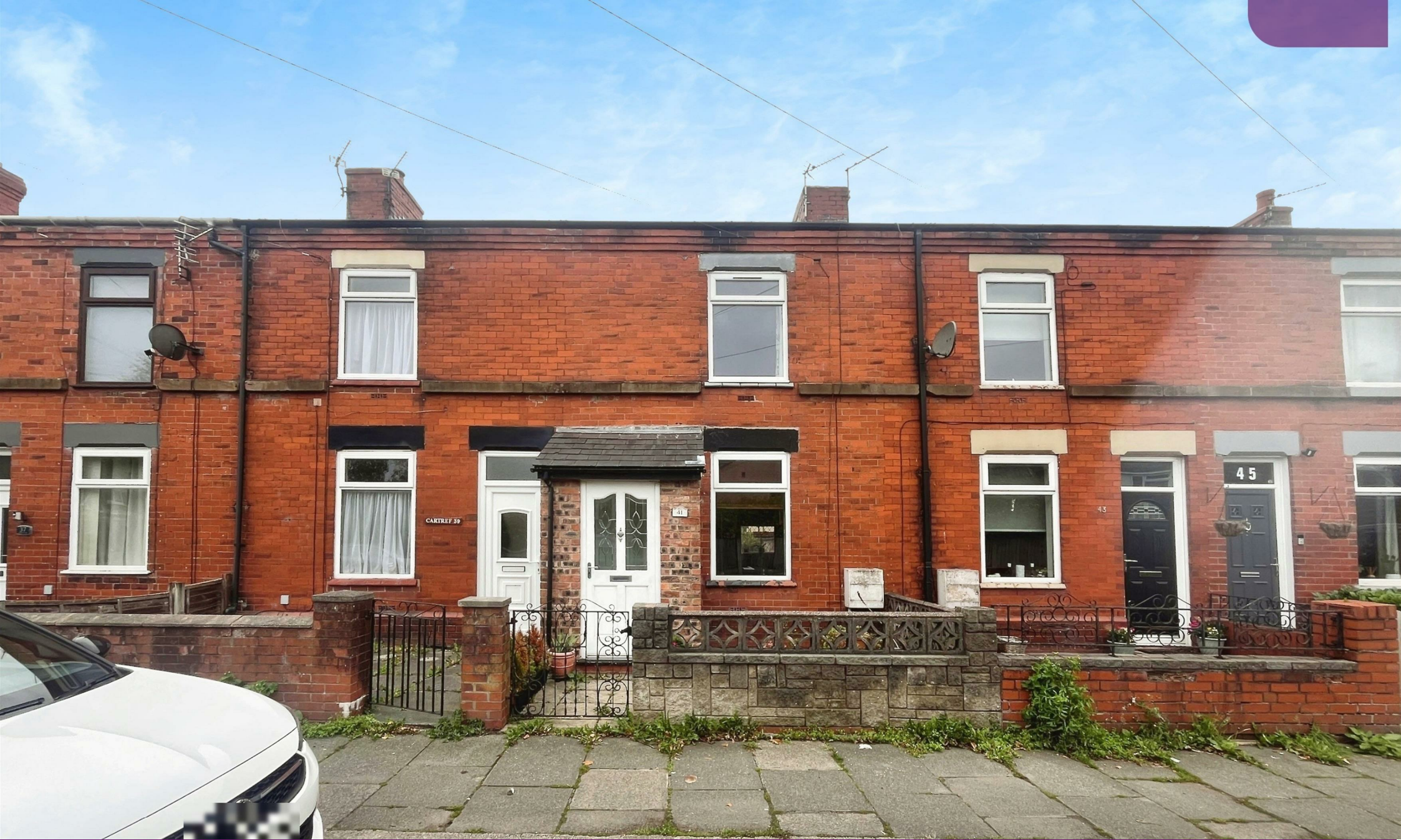
41 Sandy Lane, Lowton, Warrington, WA3 1DH Offers over £160,000